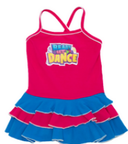
Tutu Frill Dress

All Ready Set Dance, students will be required to wear the official uniform that we are sure you will love. Below are the following options that can be purchased at reception during class times or online via our webpage shop ONLINE SHOP